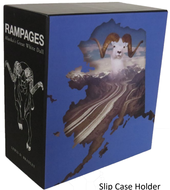
Slip Case Holder